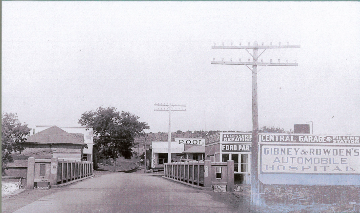
Picture 1920 Maple Street looking toward Bayard Street, Smoke House back left, 301 Bayard Street back right.