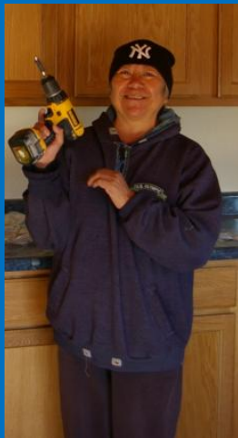
SSC Construction San Felipe Pueblo