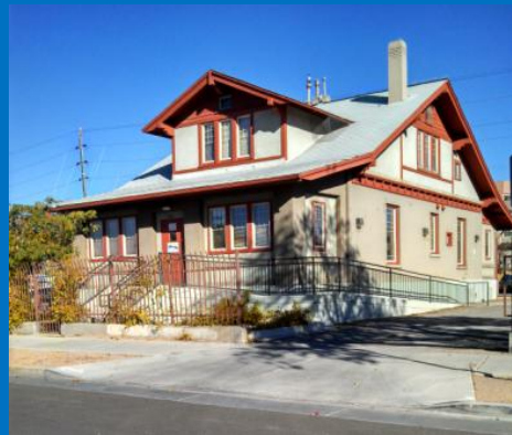
The Loan Fund office is located at 423 Iron Ave. SW