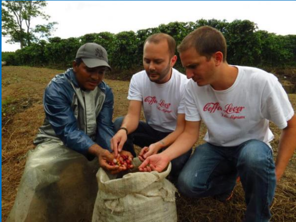
Villa Myriam Coffee & The Brew Albuquerque