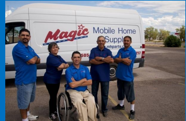
Magic Mobile Home Supply Albuquerque & Las Cruces