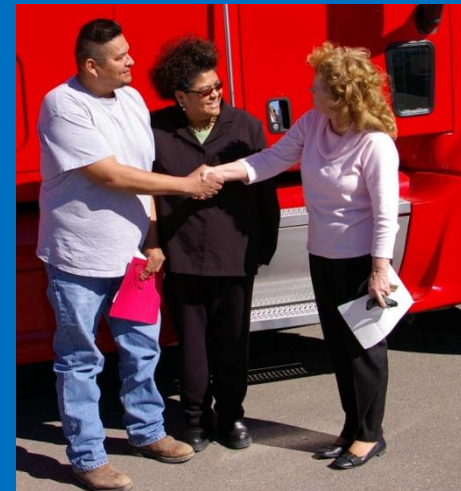
Holtsoi Trucking Crownpoint