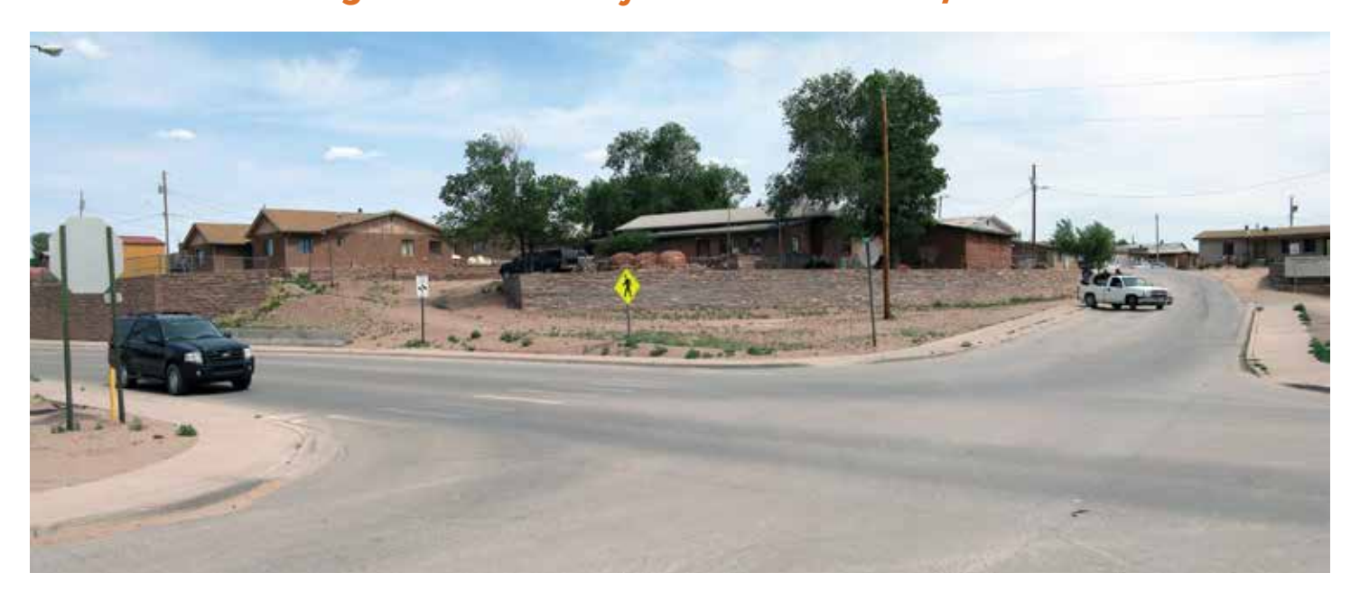
Proposed Design Hwy 53 at Pia Mesa Rd/Pincion St.

Project: Zuni Four-Way Intersection Pueblo of Zuni, Pedestrian Safety Improvements Existing Conditions Hwy 53 at Pia Mesa Rd/Pincion St.