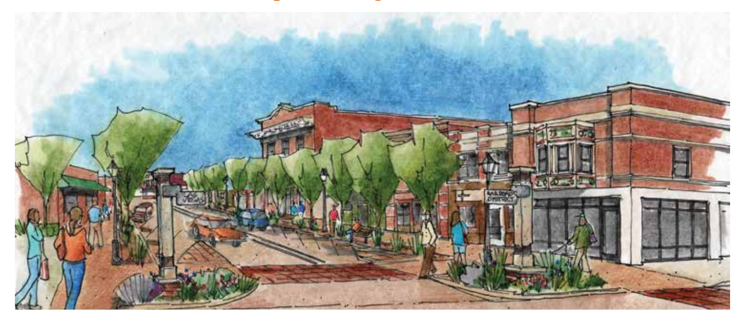
Las Vegas will work on an infrastructure project on Railroad Ave. and Lincoln St. that includes the Railroad Multi-Modal Depot and the historic Castañeda Hotel. The project will revitalize the area by preserving and restoring existing building storefronts, creating pedestrian improvements, streetscape enhancements, and wayfinding signage.