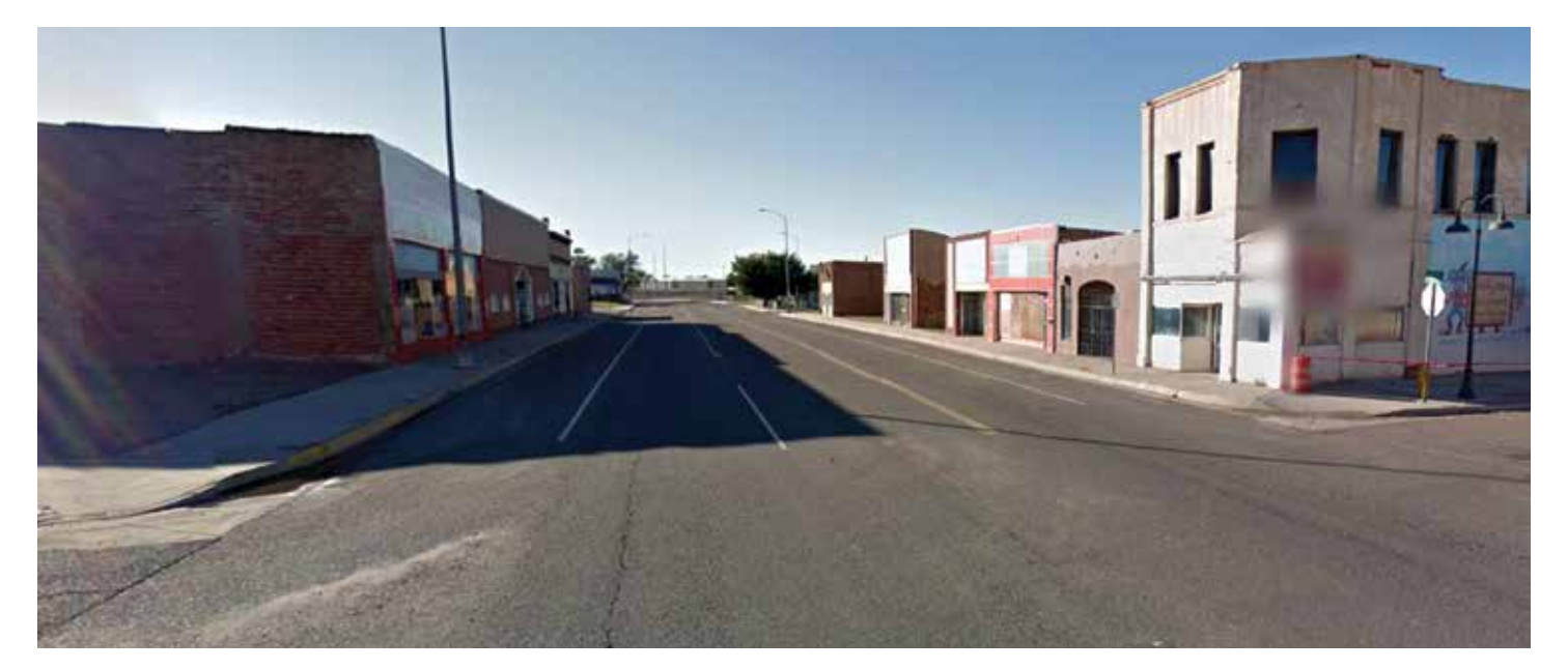
Proposed Design First St.