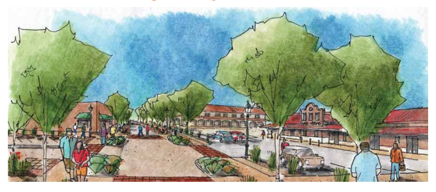
The project will consist of historically appropriate design in the areas of façade improvements, lighting, public art, and seeks to create linkages with other commercial corridors within the MainStreet District.