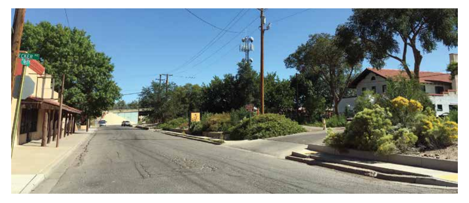
Proposed Design First St.

Project: First and Becker St. Pedestrian Safety and Lighting Improvements Existing Conditions First St.