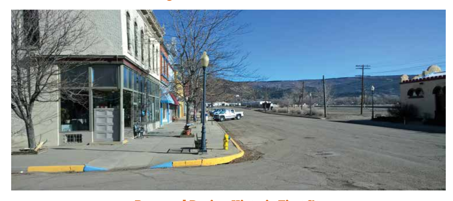
Proposed Design Historic First St.