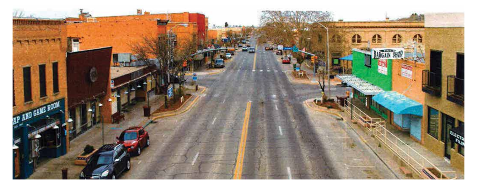
Proposed Design Orchard and Main St.

Existing Conditions Orchard and Main St.