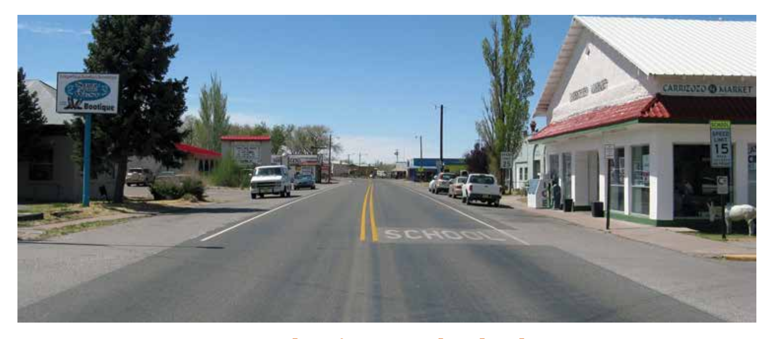
Proposed Design Central and 12th St.

Existing Conditions Central and 12th St.