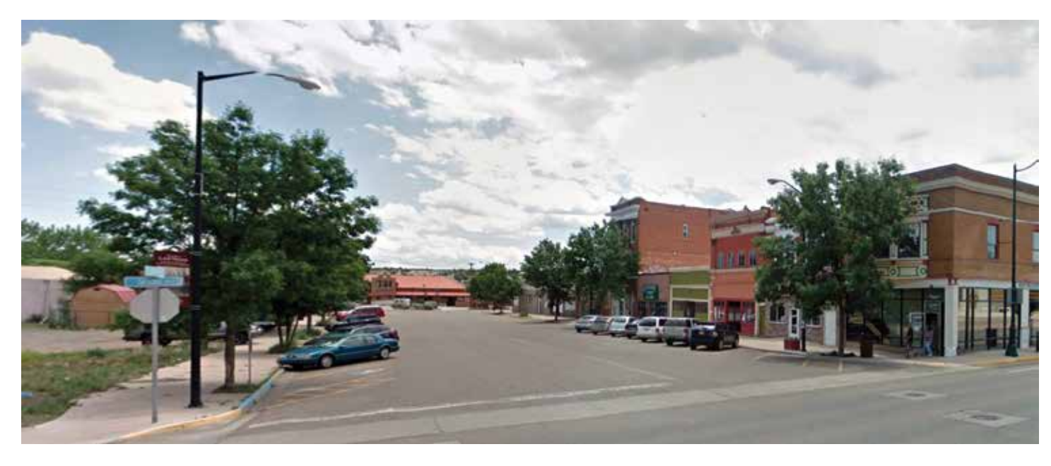
Proposed Design Lincoln St.