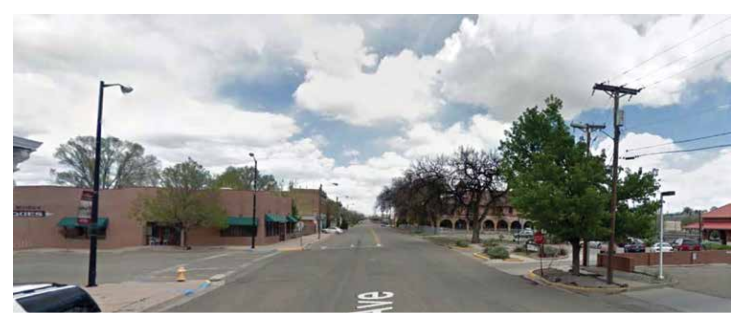
Proposed Design Railroad Ave.