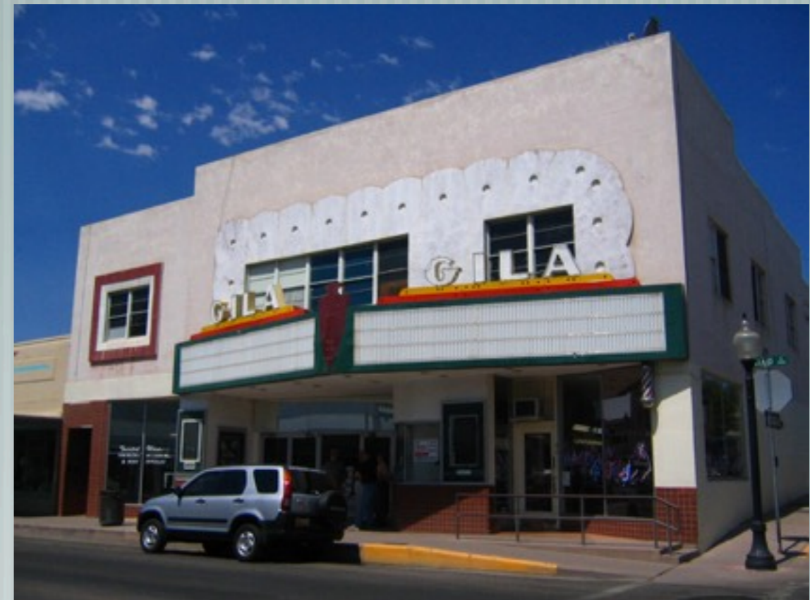
Gila Theater, Silver City

— [ Private and non-profit developers of cultural facilities may be considered