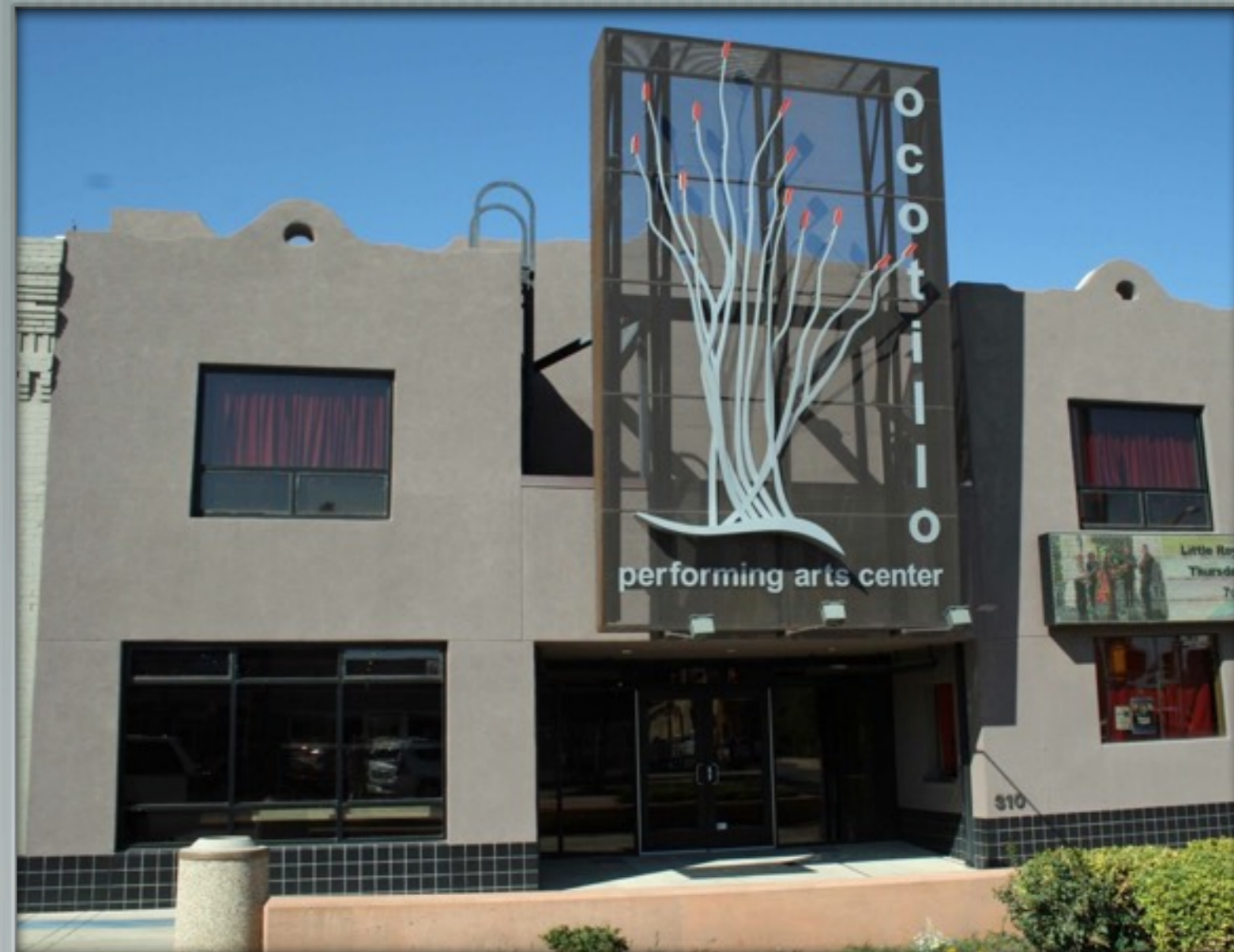
Ocotillo Theater, Artesia

Artesia - utilizes "metro redevelopment" qualifying entity to do economic development planning - Theater District, new Artesia Hotel, "white elephants"