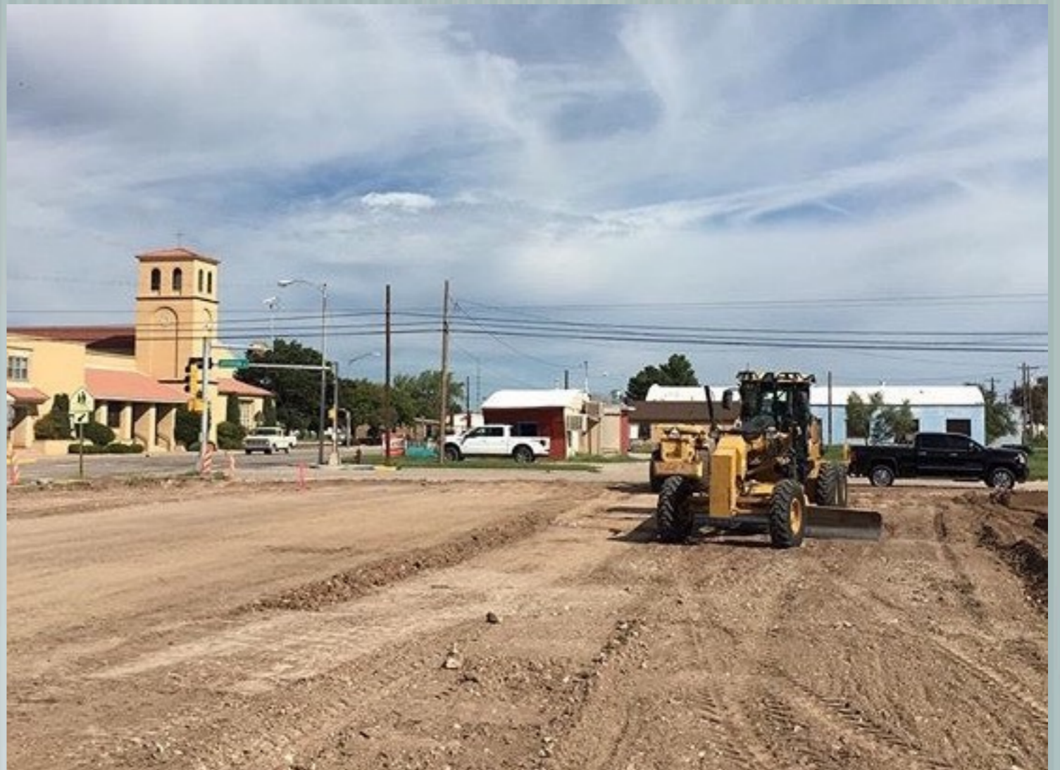
Drylands Brewery Site Construction, Lovington

LEDA review agency usually an economic development agency/org. (EDO)