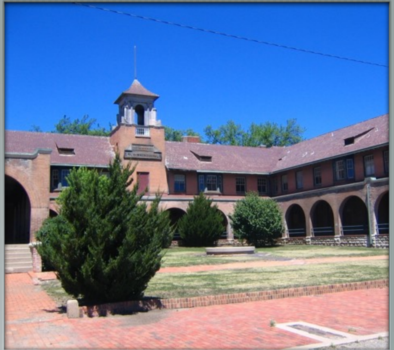
Castañeda Hotel, Las Vegas

— [ Pledge security equal to LEDA investment