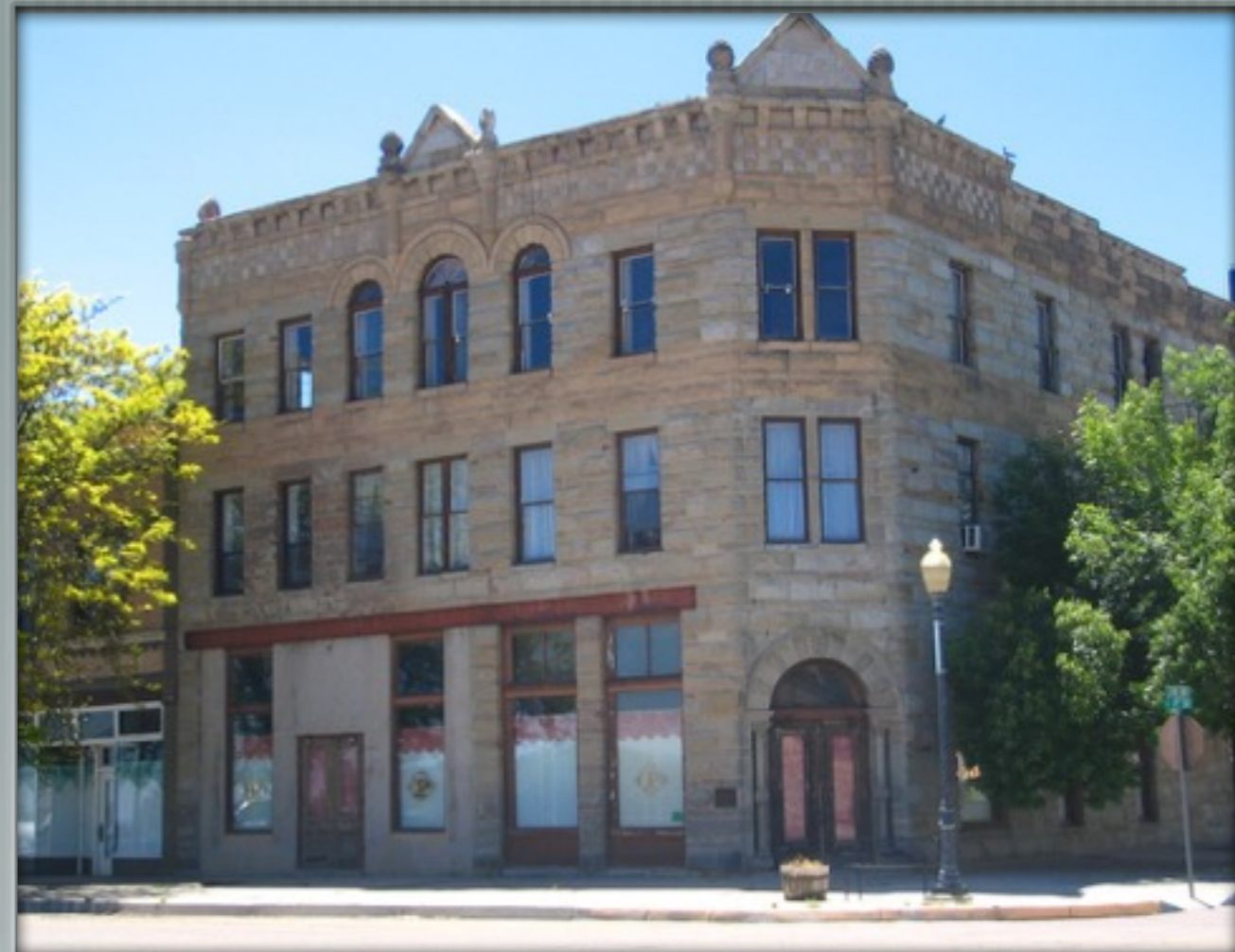
Palace Hotel, Raton

Projects must conform to an economic development plan