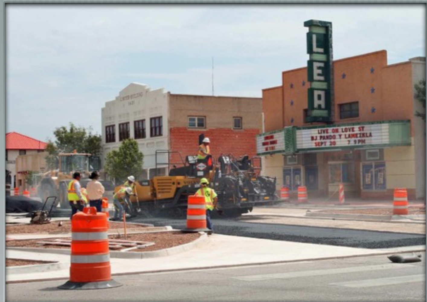
Lovington Streetscape Improvements

— [ Community Capacity, Planning and Economic Development