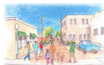
Alley Improvement Project