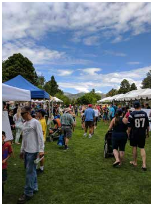
Los Alamos ScienceFest, with 15,000 attendees, was a significant economic support for area artists and art vendors