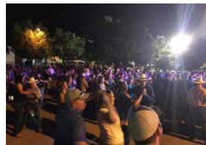
Red Dirt and Black Gold Festival