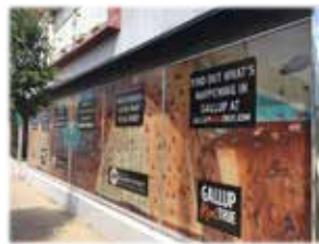
Vacant Building Window Wraps