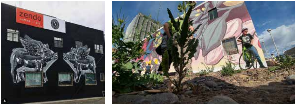
Mural Fest, a project of Warehouse 508 and the Maddox Co.

The organization produced or collaborated on a number of events that is building a stronger sense of place and vibrant atmosphere in downtown Albuquerque. Their initial signature event, the Downtown Block Party festival of arts and culture was launched on September 16 and included local musicians, vendors, food trucks, outdoor games, and craft beer from local breweries. Downtown Albuquerque ACD was a key partner in the Somos Abq Festival and they also worked with Warehouse 508 to promote Mural Fest a walk/bike tour of downtown Albuquerque’s public art.