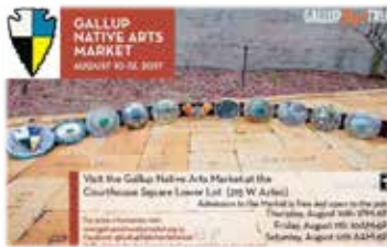
Native Arts Market Launched in August

The group, working with the City of Gallup and technical assistance provided by New Mexico MainStreet completed design work for improvements to the alleyway between the municipal government offices and the downtown district. They also installed window wraps on a number of downtown buildings aimed at promoting vacant properties for adaptive reuse by local arts and cultural enterprises.