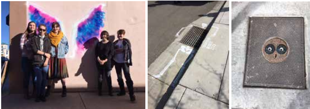
Temporary art additions in the district included the Angel Wings and Halloweekend chalk art installations