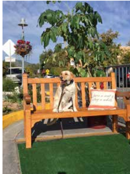
Park(ing) Day on Central Avenue