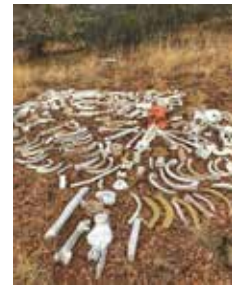
Clay art is central to Silver City ACD's efforts (l-r: Bowls for Hunger, Silvery City Clay Festival, and One Million Bones installation)

Silver City Arts & Cultural District hired a new director in 2017 and initiated comprehensive organizational development activities including a strategic planning process that culminates in early 2018. The organization has identified key strategies and goals through this process: