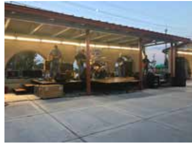
The Gate City Music Festival, Oktoberfest at Multi-Modal Parks supported growth of tourism and lodging revenues in Raton

Business development was a significant element of the ACD offerings; they partnered with the Raton Arts Council to allow new art entrepreneurs to use the RAHC's education building to hold entrepreneurship and arts classes. The group also held 2 recycled art camps for youth at the same location. The team also installed recycled tire flower pots were throughout the district.