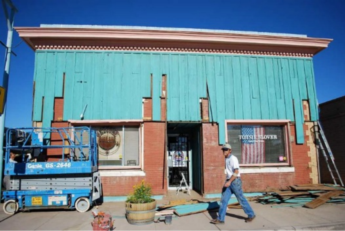
Restoration in Process