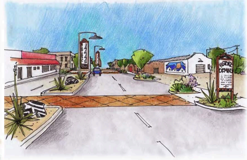
City Gateway Features