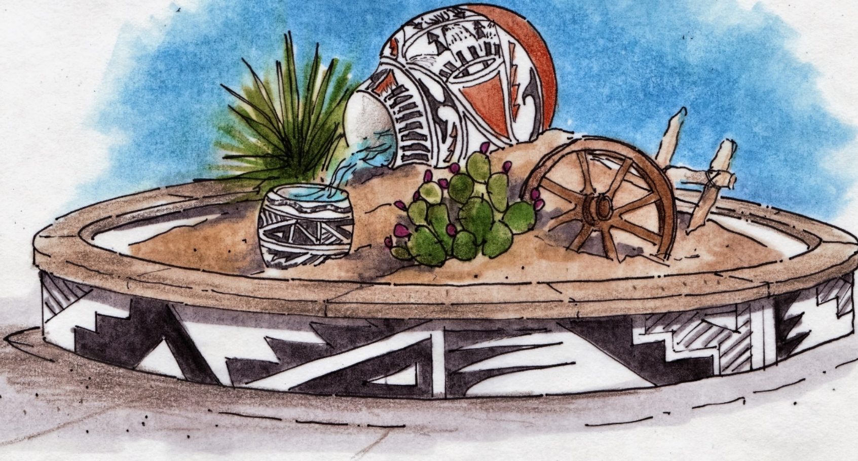
VIEW of PROPOSED FOUNTAIN DESIGN