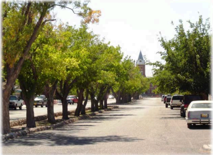
Silver Avenue Corridor