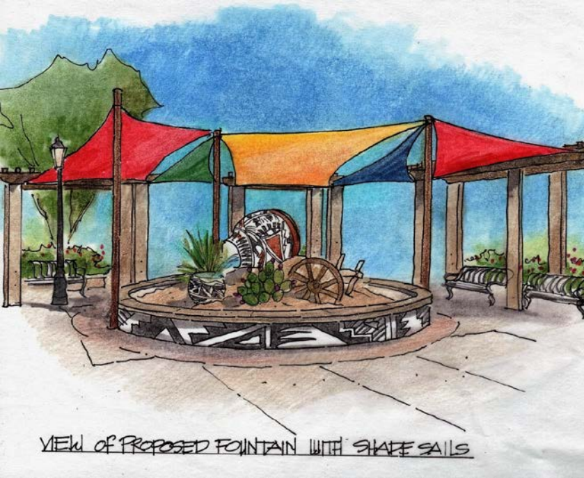
VIEW OF PROPOSED FOUNTAIN WITH SHAKE SAILS